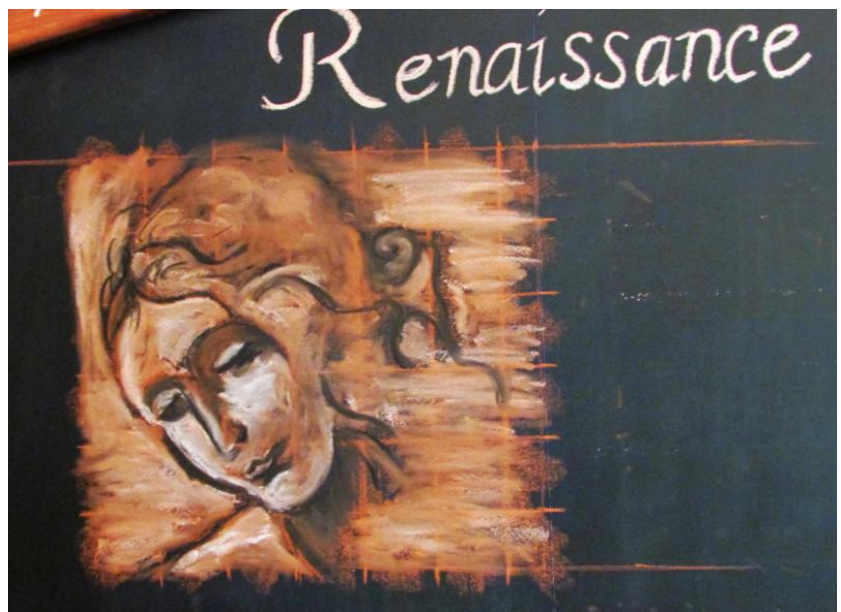
Chalkboard Drawing Class 7

Parent/Teacher Interviews Advent Spiral at SWS Winter Recital Social Health Basketball Teams & Schedule Winter Fair Thank Yous Island Oak Invitation Glenora Farm Invitation December Classifieds