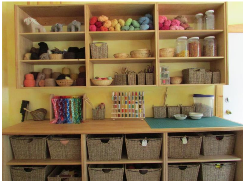
Our Beautiful Handwork Room