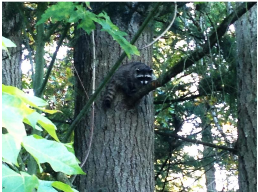
A raccoon is as curious as the children, watching the Blacksmith demonstration during our Michaelmas Festival.