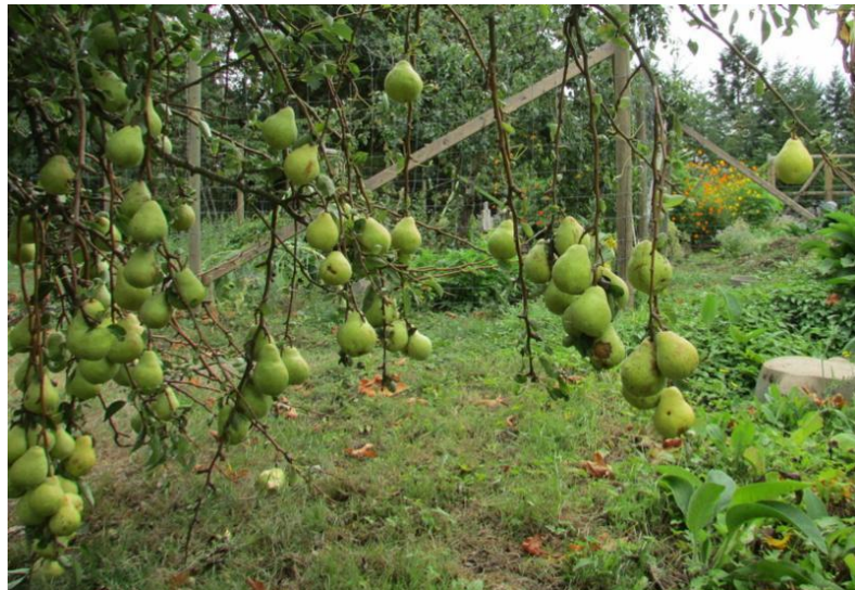
The Fruit is Ready