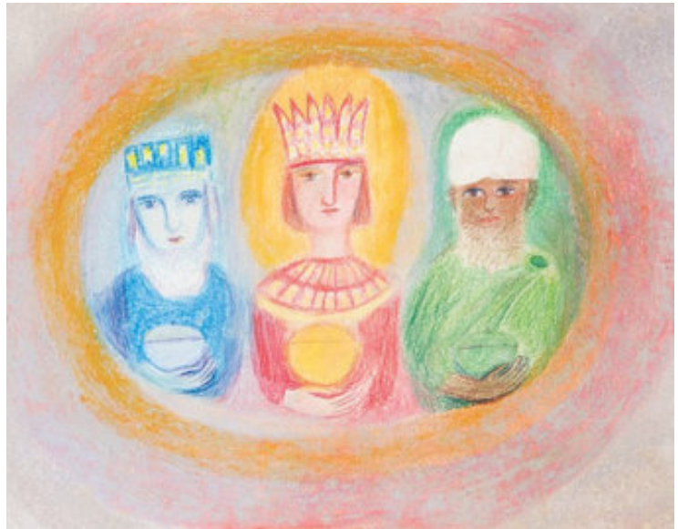
The Three Kings

Celebrating Epiphany Accessing Social Health Support 2016 Basketball Schedule